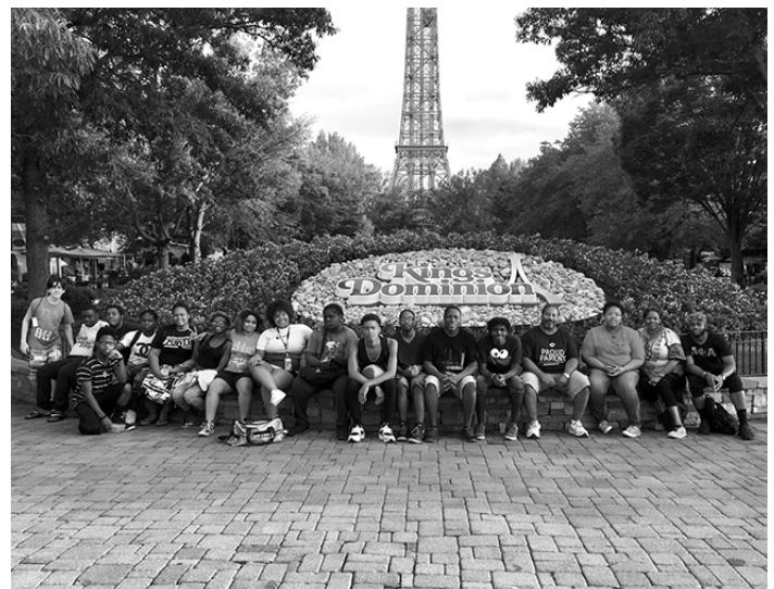
The 2016 Leadership In Action Summer Institute culminated with a fun-filled day at Kings Dominion.

Learn more about Armstrong Leadership Program through Yvette Rajput at 804-783-7903, ext. 13, or, alp@richmondhillva.org